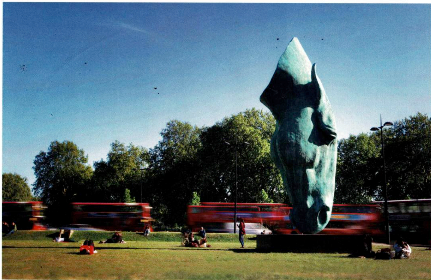
Above: Motionless amid the bustle: Still Water by Nic Fiddian-Green. Facing page: Aptly named: Hares Monumental by Hamish Mackie