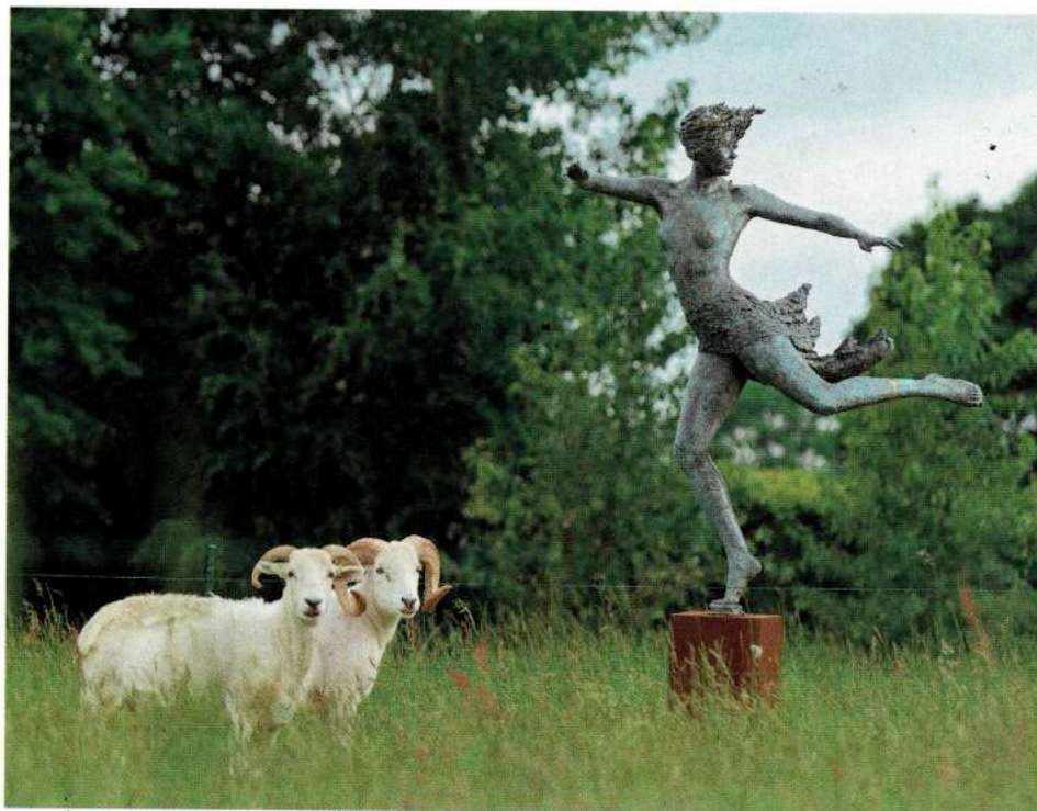
Above: Poised: Squall by Mr Williams-Ellis. Below: Maquettes for his 10 bronze soldiers in northern France, made to commemorate the 75th anniversary of the D-Day landings

sunken courtyards. 'I installed one at a water-mill, which required a temporary bridge to carry not only two tons of bronze, but also the cranes needed to erect it,' she remembers. 'The result is spectacular: sculpture is such a fantastic way to engage with an open-air space and it changes each day through the seasons.'